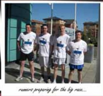
receivers preparing for the big race...