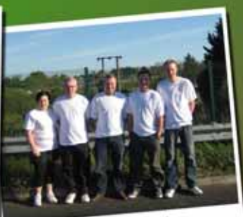
team 4: the wily collectors