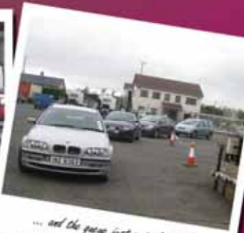
... and the queue just gets longer!