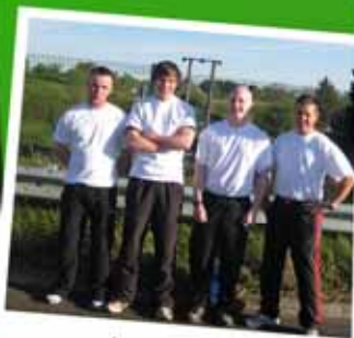
team 2: the runners