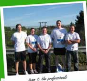
team 1: the professionals