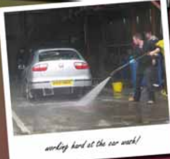
working hard at the car wash!