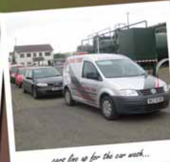
cars line up for the car wash...