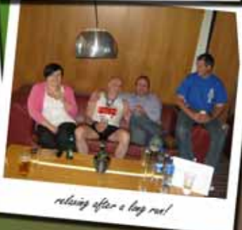
relaxing after a long run!