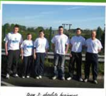
team 3: absolute beginners