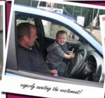
eagerly awaiting the excitement!